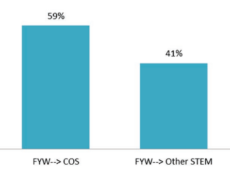
Figure 10.2. Percentage of students reporting transfer of metacognitive writing practices between courses as frequently/very frequently/all the time.