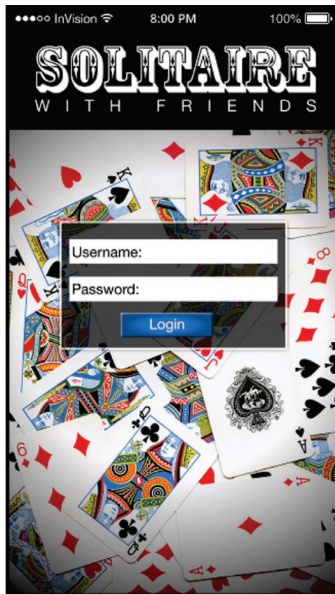
Figure 20.3. "Cloaking" feature of Safely Social . A dynamic, clickable version of this image is available at http://invis.io/2BKEXP95

paper prototype, the design community said there was a need for the app to be hidden on the phone. Advocates described how abusers monitor every aspect of a survivor's life, including survivors' phones and computers. Another obstacle is that abusers and survivors usually share cell phone and app store accounts. In an effort to address monitoring concerns, the development team chose to design a "camouflage" or a "cloak" for the app. The cloak is simply a login screen that appears to be a game. Once logged in, the actual home screen appears. Safely Social also features a "stealth" mode. With a quick click, the app reverts back to the "cloak" screen. This allows the survivor to toggle between the "cloak" or game and the real functionalities of the app.