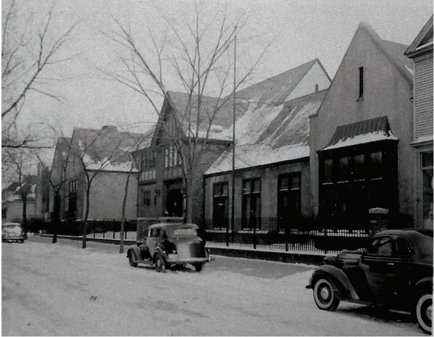
Figure 5.1. The new Tau Beta Community House, funded in part by Detroit's "Building For Womanhood," philanthropic campaign.