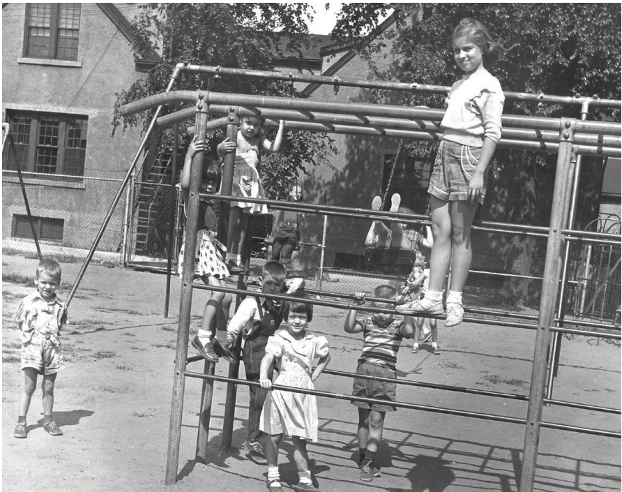
Figure 5.2. Children playing on the Tau Beta Community House playground.

the adjustment of the foreign-born citizen and his [sic] family to American life” (Social pioneering, 1926). Helping immigrants adjust effectively required more space. Quarters for the health clinic that was run in cooperation with the Visiting Nurse Association were cramped. The mortality of infants was at stake as well. Since the Visiting Nurses Association had begun its work in Hamtramck in 1914, infant mortality had decreased by roughly half, an arguable result of the “better babies, better citizens” mantra circulating at the settlement. Space was needed for young women’s fine and domestic art instruction and recreation facilities for the boy’s youth programming. The opportunities for recreation and amusement in this new space for boys in particular would purportedly cut down on juvenile delinquency. Two hundred and forty-five boys had passed through Hamtramck’s Juvenile Court in 1926. The staff had also increased considerably since the settlement’s inception. The reported material support in 1926 reflects the method of “cooperation” built into the Tau Beta settlement model: five full-time workers were paid by the City of Hamtramck, seven full-time and 11 part-time workers were paid by the Detroit Community Union, and seven full-time and two part-time workers were paid by the Visiting Nurse Association.