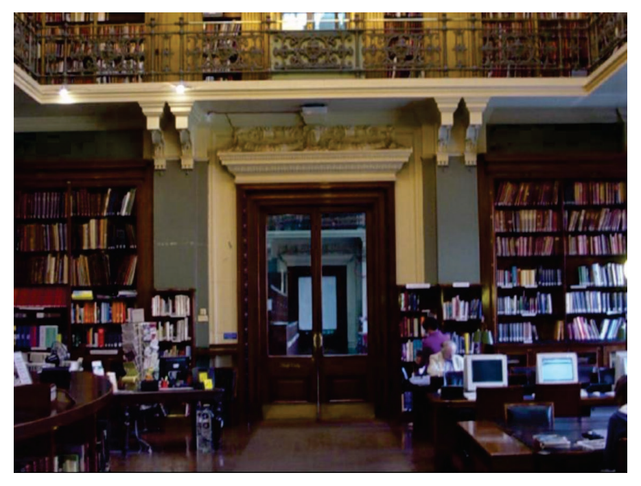
Figure 4.1. Victoria and Albert Museum in London.

the V&A special collection for an article I was writing (see Figure 4.1). To put it more simply, I was conducting a kind of humanities research in a very conventional way—identifying a purpose, tracing textual sources in a sanctioned library, drafting and revising. (Research in other fields takes various forms, of course, including field work and lab work.)