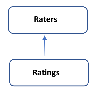
Figure 2. Two-level nesting.

This data independence violation has important implications for reporting the strength of correlations and the regression model's ability to explain/predict variation, with a greater chance that the resulting model is more susceptible to Type 1 measurement errors. These Type 1 errors raise the possibility that significance claims/variation explanations are inflated because they are only based on group aggregations (Heck & Thomas, 2000; Hox, 2002; Kreft & de Leeuw, 1998; Raudenbush & Bryk, 2002). In other words, when we use multiple linear regression on dependent data points, we run the risk of obtaining statistically significant correlations between variables that are false positives due to our failure to take into account random variation from moderating or intervening variables that arise from the corpus hierarchy.