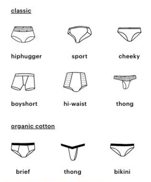
Fig. 2. Thinx underwear styles.

refigure assumptions about who menstruators are and what their needs might be. Further, the inclusivity commitment of Thinx is not just related to exploring the body but also to interacting with bodies through extensions that value how wearable technologies work with bodies.