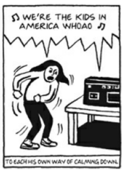
Fig. 5. - Page 134 of Persepolis Pantheon Books, New York, 2007. The frame on the left contains a cassette with a tape being inserted accompanied by a text box at the top of the frame stating, "I got off pretty easy considering. The Guardians of the revolution didn't find my tapes." The second text box illustrates Marji dancing to the music from the cassette with a text box at the bottom of the frame reading, "to each his own way of calming down." A text bubble in zigzag shape at the top of the frame reads, "We're the kids in America...whoao."

The above images show a young Satrapi searching for contraband, like a fugitive, dodging Islamic revolutionary guards and their seizure of such goods. In former colonies and semi-colonies, consumption of Western media, like skin bleaching, is imbricated with class and economic dynamics informed by global colonialism which, in the case of the Middle East, is also very often connected to patterns of religious belief. In Iran, postrevolutionary measures taken to rehabilitate native culture to rebuild Iran after the ravages of colonial theft are illustrated as random acts of Islamic authoritarianism. Such a depiction, in all its dramatic pathos, will resonate with an audience who will react positively to the image of a young Iranian girl yearning for American popular culture goods as if the scene is untouched by colonialism and its structures of harm and gain. In this example of an Iranian girl opposing "extremism" by resisting an Islamic boogeyman, the echoes of Islamophobic and Eurocentric rhetoric emanate in the undue focus on culture and religion—a position that parallels the famous 'clash of civilizations' thesis that has been thoroughly discredited for its obscuring of economic and political forces that underlie regional tensions<sup>15</sup>.