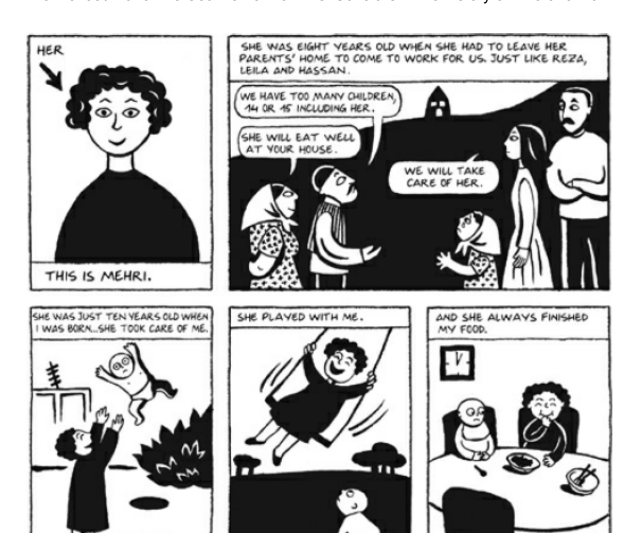
Fig. 6. - Page 34 of Persepolis Pantheon Books, New York, 2007. This figure contains five frames in black and white with capital letters. The top left frame has an image of a young girl with an arrow pointing to her stating, "her," "this is Mehri." The second figure illustrates a scene in rural Iran featuring Mehri's parents handing over Mehri to Satrapi's family as a servant. The third frame shows a young Mehri looking after an infant Satrapi. The third shows the same scene in a playground. The last scene shows Satrapi and Mehri sitting at a table eating with a text box stating, "she always finished my food."