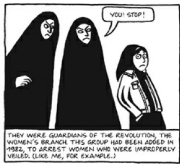
Fig. 4. - Page 132-133 of Persepolis Pantheon Books, New York, 2007. The frame on the left illustrates Marji walking down a street in Tehran with a text box above her head reading. "We're the kinds in America...whoa" in all capital letters as a group of revolutionary guards (women) clad in Islamic veils advance upon her, pointing. The second frame shows Marji apprehended by the women while she looks into in the direction of the audience. A text box at the top of the second frame reads "You! Stop!" uttered by the guards accompanied by another text box at the bottom of the frame reading, "They were guardians of the revolution, the women's branch. This group had been added in 1982, to arrest women who were improperly veiled. (Like me, for example)."