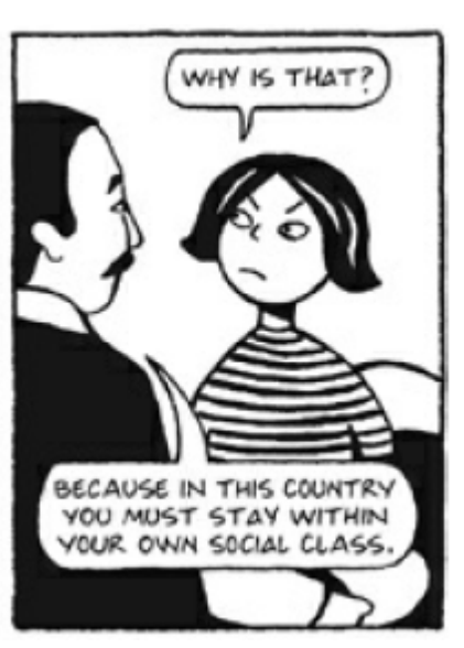
Fig. 7. - Page 37 of Persepolis Pantheon Books, New York, 2007. This figure contains two frames. The one on the left shows Marji speaking with her father in her bedroom as they discuss class dynamics. Her father says, "you must understand that their love was impossible." The second frame shows Marji and her father disagreeing about the inflexible nature of class lines in Iran with two text boxes: one from Marji stating, "why is that" and one with her father's response, "because in this country you must stay within your own social class."

Explaining the importance of maintaining rigid class lines in Iran, this scene illustrates the issues resting at the heart of many revolutionary struggles: inequality and exploitation. While one generation reinforces these class divides, a young Marji questions them, providing readers a glimpse into another very different story buried in the iconic memoir—one that is not captured in the idea of dispelling myths about Iranians by denouncing the 'wrongdoings of a few extremists.'