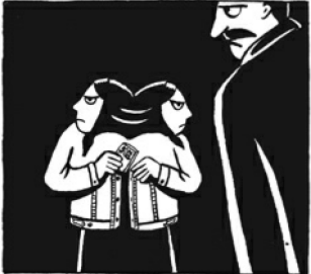
Fig. 3. - Page 132-133 of Persepolis Pantheon Books, New York, 2007. The first frame is illustrated in black with two figures etched against this background. One is a salesman wearing a long black coat carrying contraband and stating "110 Tumans" in response to a young Marji who stands beside him asking, "how much?" Above them, a line of text reads, "I bought two tapes: Kim Wilde and Camel" in all capital letters. The second frame illustrates this same scene with a young Marji departing with a set of tapes.