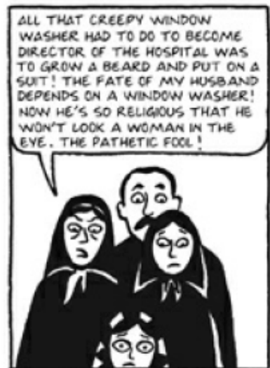
Fig. 9. - Page 121 of Persepolis Pantheon Books, New York, 2007. This figure contains three frames featuring five characters. Marji, her parents, her aunt, and a hospital administrator. The first and second frame shows a conversation between Aunt Firouzeh and the administrator in which approval for foreign travel is denied. The third frame illustrates the family, minus the administrator, reviewing this result with outrage.

Contempt for the lower classes, and a sense of their having a rightful place, is sharply apparent in Aunt Firouzeh's frustration, which is informed by attachments to an Iranian economy arranged by British and U.S trade agreements dividing Iranians along class lines<sup>23</sup>. As such, Satrapi's account of the revolution does not present "Tales from an Ordinary Iranian Girlhood" as subheadings have suggested but rather illustrates "an association of social interests" between the dominant groups of disparate nations in the name of literature and feminism (Chute 136; Quijano 166)<sup>24</sup>.